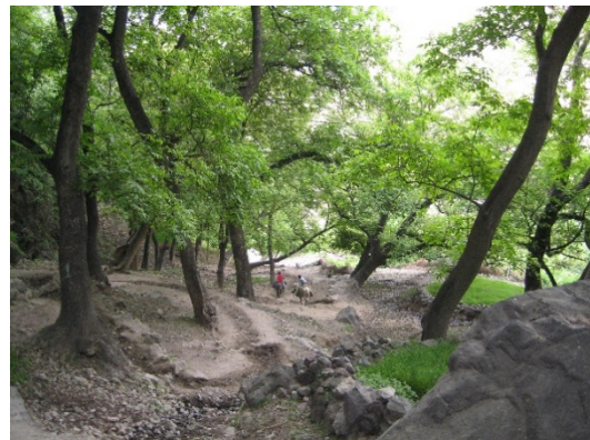
Forests and trees offer shade, food and water in regions suffering increasingly from drought and heat, such as Morocco, but are threatened at the same time.

Vienna, March, 21, 2023 - The global scientific evidence of the multiple types of benefits that forests, trees and green spaces have on human health has now been assessed by an international and interdisciplinary team of scientists. The outcome is presented in a major report titled “ Forests and Trees for Human Health: Pathways, Impacts, Challenges and Response Options ” by the Global Forest Expert Panels (GFEP) Programme of the International Union of Forest Research Organizations (IUFRO). IUFRO unites more than 15,000 scientists in more than 630 member organizations – mainly public research centers and universities – in 115 countries and is a member of the International Science Council.