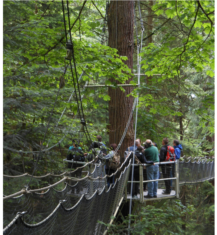
A different view to the old growth forest: the Greenheart Tree Canopy Walk during the in-congress tour at the University of British Columbia campus at Point Grey Peninsula.

who are up to three years post-PhD to make a 5-minute oral presentation of their research findings in the field of wood science and technology or other forest-related disciplines that are linked to forest products. Presentations followed many comments and useful suggestions from the audience.