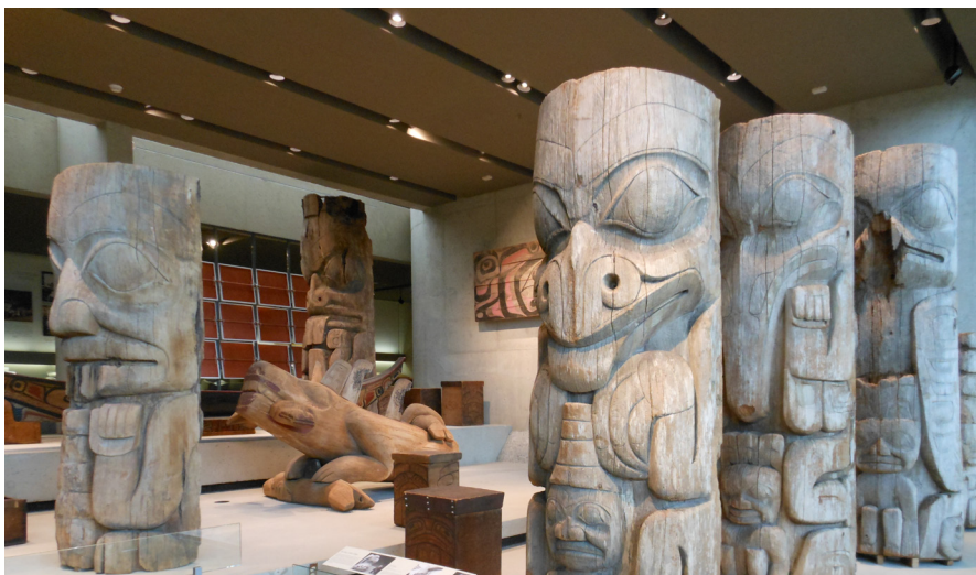
The conference dinner was organized on Wednesday evening at one of Canada's foremost cultural attractions, the Museum of Anthropology (MoA) at the University of British Columbia.

The local organizing team at the UBC did an amazing job in preparing the event and securing that everything ran